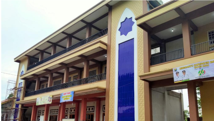
Figure 3 Three-story Building of SD Muhammadiyah Limpung