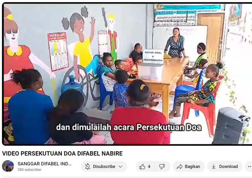
Figure 2. The screenshot of video entitled Nabire Disabled Prayers Fellowship

In figure 2 show the video entitled Nabire Disabled Prayer Fellowship was uploaded on September 4 2023. Disabled residents in Nabire Papua are taking part in a prayer meeting held at the Secretariat of the Foundation for Care of Disabled People and Orphans, Nabire Central Papua. Disabled residents were very happy and enthusiastic in participating in the prayer. The foundation always facilitates and develops people with disabilities so that they will be able to live independent lives in the future.