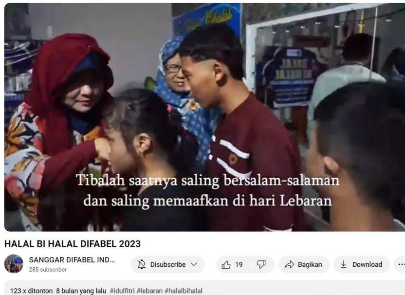
Figure 4 Screenshoot the video entitled Halal Bi Halal Difabel 2023

The video entitled Learning to Read the Koran was uploaded on 20 July 2023. Islamic PAUD, Kindergarten and Elementary School students in Nabire Papua learn to read Iqro. These Islamic religious lessons are given so that students in the future will become intelligent and religious teenagers, devoted to Allah SWT so that they have the strength of faith in facing life.