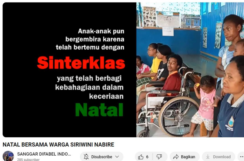
Figure 5 Screenshot the video entitled Christmas with The Citizen of Sriwini Nabire