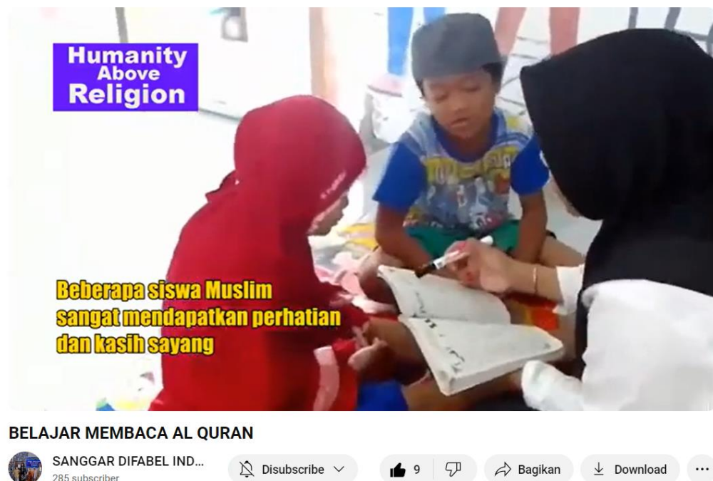
Figure 3. Screenshot of video entitled Learning to Read the Koran

In figure 2 show the video entitled Nabire Disabled Prayer Fellowship was uploaded on September 4 2023. Disabled residents in Nabire Papua are taking part in a prayer meeting held at the Secretariat of the Foundation for Care of Disabled People and Orphans, Nabire Central Papua. Disabled residents were very happy and enthusiastic in participating in the prayer. The foundation always facilitates and develops people with disabilities so that they will be able to live independent lives in the future.