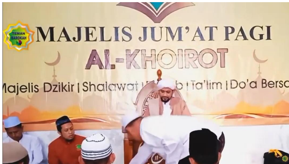
Figure 2. The practice of Ratib al-Haddad MJP Al-Khoirot on November 2021

If traced further, the practice of Ratib al-Haddad from the last month of July 2021 to the end of October 2021 experienced an increase. This detection is based on the search for a trending object through the help of web-based https://trends.google.co.id search engine sites and Youtube. So, if traced with a few words as a comparison, then Ratib al-Haddad is still the most in-demand word. The assumption is also the most practiced, especially the month of October also coincides with the month of Maulud Nabi, which the Alawiyyin and its worshippers widely commemorate.