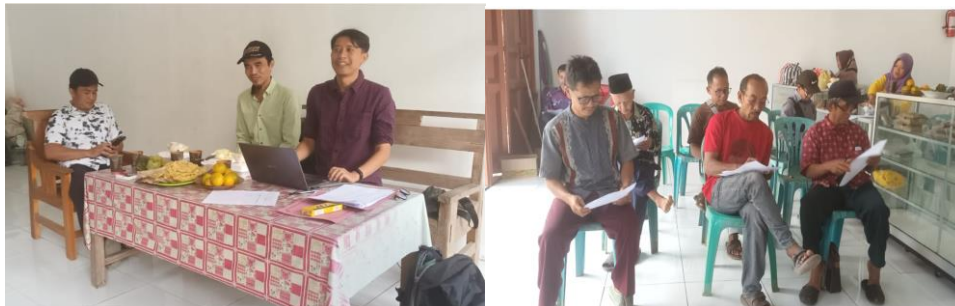
Fig. 2. Community Service Program

Participants also received intensive technical support during the training process, as shown in Figure 2. This support was carried out to ensure farmers could apply GMP in their daily production activities [8]. The support team actively provided guidance, answered questions, and helped solve problems that participants encountered during the production process.