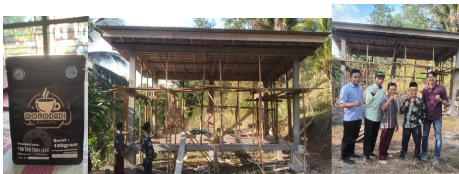
Fig. 3. Coffee Shop Products and Development in Tourist Locations

The success of GMP implementation in Wonodadi Village is supported by several factors, including the active participation of participants in every phase of training and resources, both human and financial, and mentorship, support from the local government represented by the Forestry Commission, Branch VIII, and Universitas Jenderal Soedirman, Purwokerto, Central Java in providing supporting facilities such as adequate production equipment and business stands as shown in Figure 3.