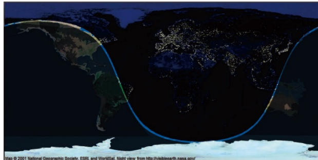
(Figure 4. Results of the Combination of Day Map - Night of the Sun above the Ka'ba and the turning point of the Ka'ba)

To help search the location, the author uses the Sky View Cafe Online application, then combines the images of day and night while rashdul qibla of the Ka'ba, and rashdul qibla the turning point of the kakkah. Image found as follows: