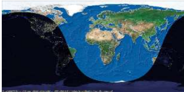
(Figure 2. Annual Map of Day and Night Rashdul Kiblat / May 28 and July 16) (Sky View Cafe Online)

From the explanation above, it can be seen that on May 28 and July 16, the places where we can execute this method are all of Africa, Europe, and all of Asia, except for Eastern Indonesia (Papua). (Gandis, 1997: 18)