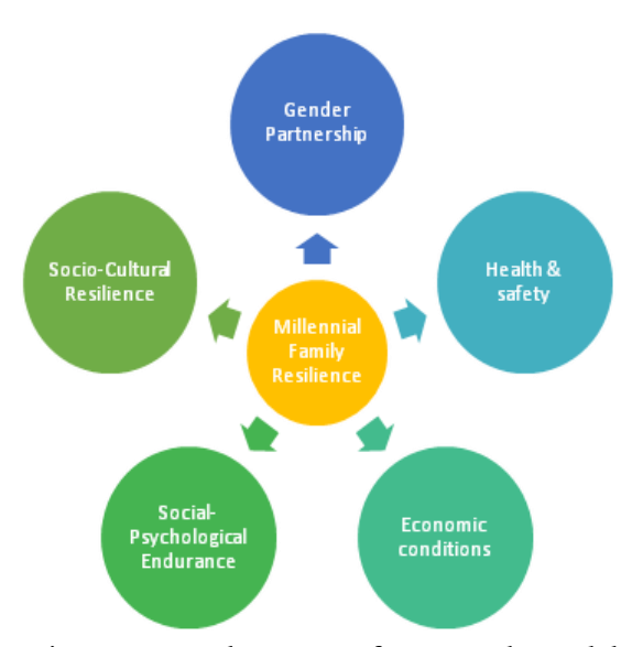
Figure I: Development of a research model

Second, gender partnership. Patriarchal culture is inherent in the majority of Indonesian families, who position men as central in the family (Khotimah, 2018: 153–154). So there is an assumption that gender roles are where the roles of men and women are formulated based on their masculine sexual type and femininity (Kasdi, 2019). Usually, the role of men is placed as a leader and breadwinner because of the assumption that men are creatures that are stronger, and identically more superior than women. While women are domestic administrators in the household. Gender Partnership is an equal and fair collaboration between husband and wife and children, both boys and girls, in carrying out all functions of the family through the division of work and roles, both the roles of the public, domestic and social community (Holman, Stuart-fox, & Hauser, 2018). In this study, gender partnership is measured by indicators of togetherness in the family, husband and wife partnership, financial management openness, and decision making in the family (KPPPA, 2016).